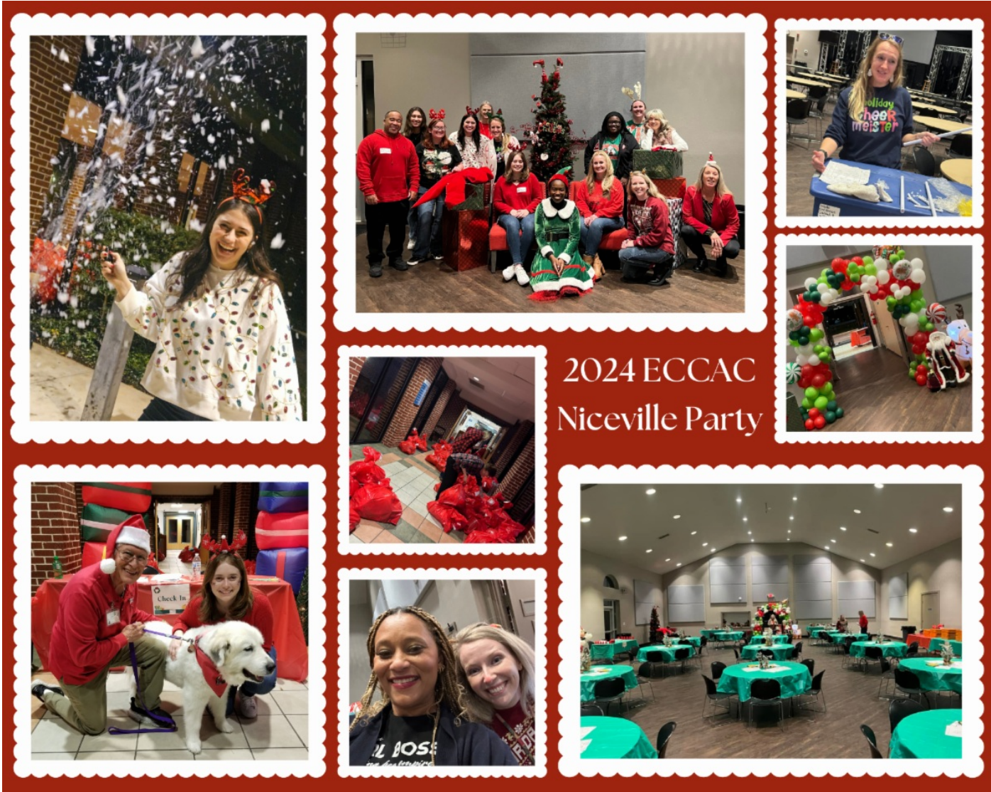
2024 ECCAC Niceville Party