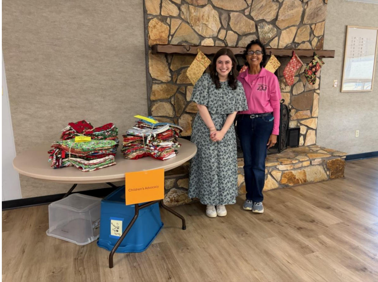
Flying Needles Quilt Guild provided stockings for our kiddos! THANK YOU!